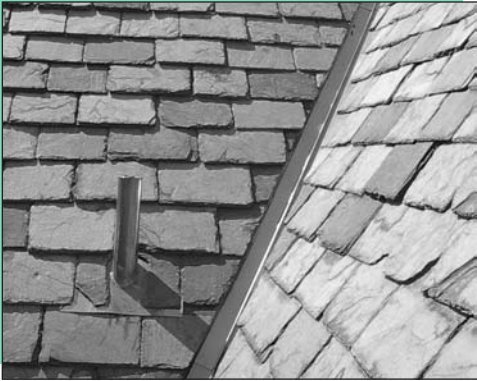
Whether it is restoring a roof to its former glory...