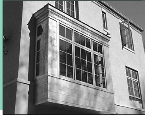
Getting creative to fulfill an architect's vision...