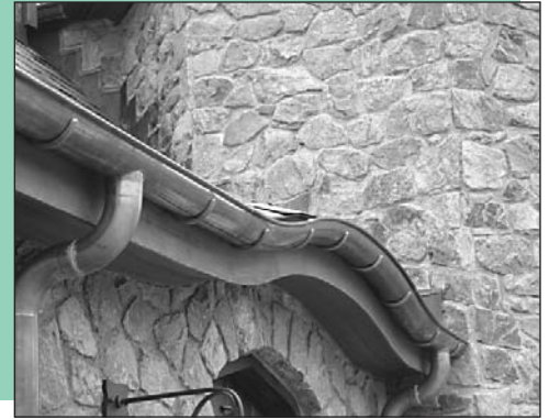
Or providing a solution for water runoff...

It's all in the detail. (The tougher it is, the better we like it.)